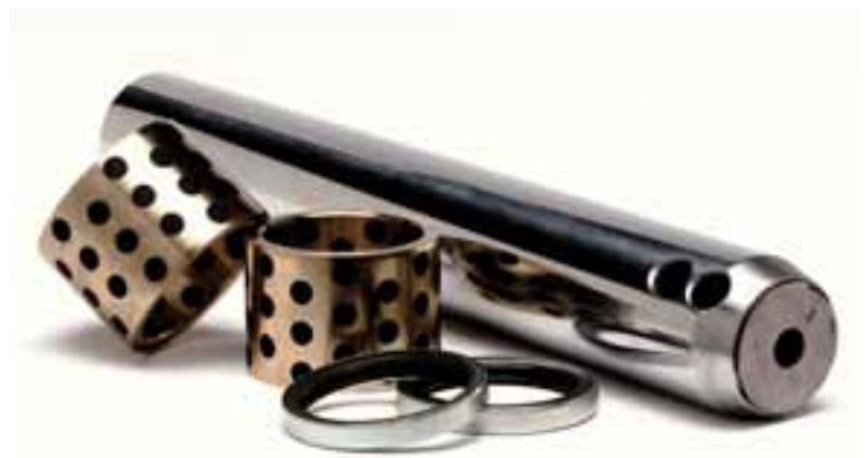
EMS chrome plated pins with brass bushing

Low maintenance Extended Maintenance Bushings (EMS) provide 1,000 hour greasing intervals, greatly reducing daily and weekly servicing for the operator. The bucket pins retain a 250 hour greasing interval. EMS bushings are now fitted as standard on all CXB excavators (previously only on machines above the CX330). Anti-friction shims in the boom foot and head reduce noise and cut free play, further increasing the well deserved Case reputation for durability and reliability, reducing ownership and operating costs for the customer.